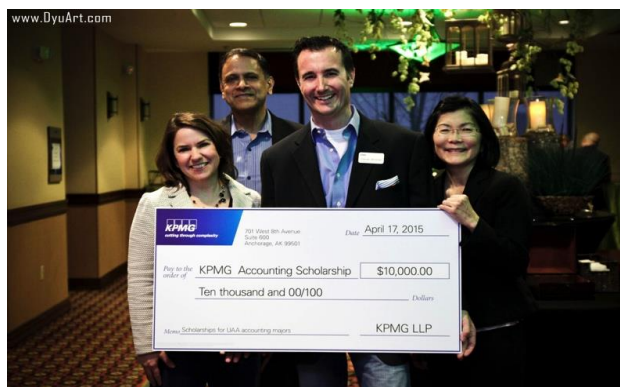
KPMG Partner and representative with UAA CBPP Staff and students

Our Spring Social at The Embassy Suites was success. Thank you to all for your support to the Accounting Club. We'd like to give special thanks to KPMG for their generous support as they are giving $10,000 Accounting Scholarship. Our sponsors and donors support help students achieve their goal.